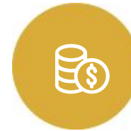
Compensation and benefit planning