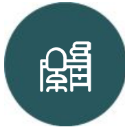
Office & IT Infrastructure